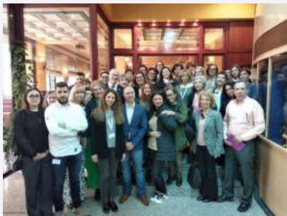
36th IUCP: As it has been established from the beginning of IUCP (1996), participants were photographed at the course venue.